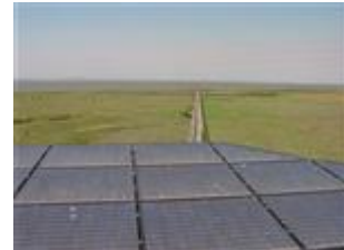
Solar panels at the Baylands Interpretive Center, one of the projects supplying PaloAltoGreen.