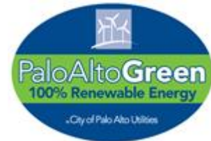
Window Cling 3.5"x5"

PaloAltoGreen 250 Hamilton Avenue | Palo Alto, CA 94301 Phone: 650-329-2161