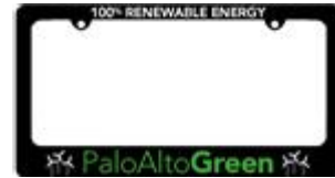
License Plate Frame

*Visit www.cityofpaloalto.org/pagreen to learn about the methodology used to calculate these environmental equivalencies.