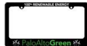
License Plate Frame

PaloAltoGreen yard signs, license plate frames, stickers, and window clings are all free upon request. Check out the available items below. If you'd like a yard sign, simply click here . For a license plate frame, stickers, or window cling, email your name, address, and a list of the items you want to paloaltogreen@cityofpaloalto.org