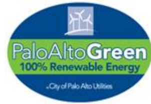
Oval Sticker 2"x3"

Do you know someone in Palo Alto that might like to support